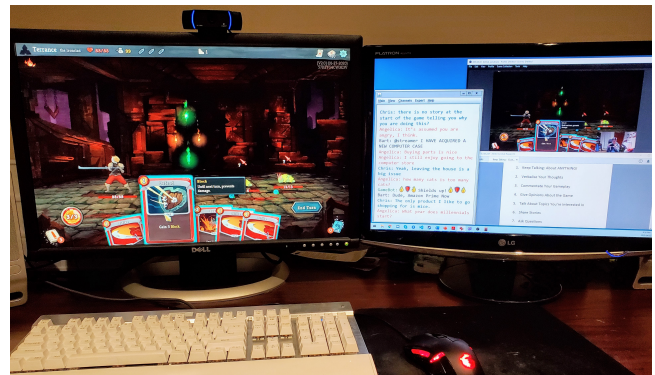
Figure 4: Study participant streamer task setup. The left monitor contains only gameplay. The right monitor displays Chatty, Open Broadcaster Software (OBS) showing a live feed of gameplay and the participant on webcam, and our seven streaming tips.

Participants' verbal performance was noticeably different when Audience Bot was present. When performing without Audience Bot, all participants focused on the game as they played, rarely heeding the latter half of our list of streaming advice related to topics outside the game. Alternatively, when Audience Bot was